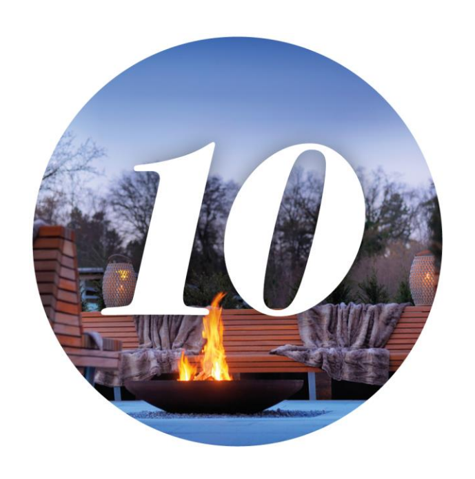
The Garden Beauty grows, year after year

Green is not everything, but without green everything is nothing. And what would a Giardino hotel be without a garden? Naturally, it will take a few more years before it will show its full splendour, but the foundation has been masterfully laid by the landscape architects. On nearly one hectare of land there is a rose garden, a shadow garden and a herb garden. Shrubs and fescue grasses surround the pond. Water gently runs down a rocky slope. And in summer, flowers will bloom on the meadows. The hotel's chefs are already looking forward to harvesting our own cherries, apples, pears and walnuts. Giardino-like — after all, nomen est omen!