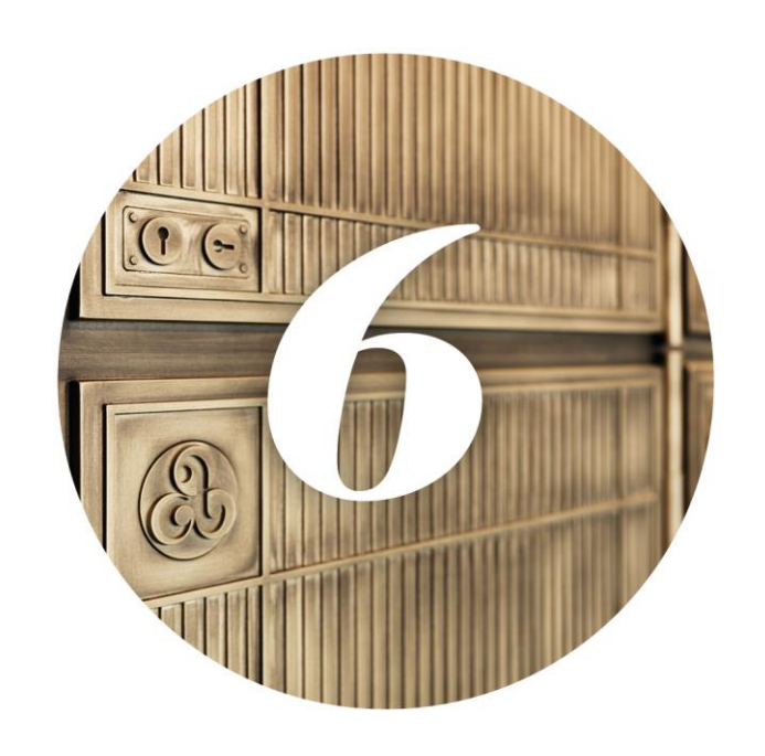
The Bar Stringer with a view

What makes a bar remarkable? A remarkable bar has an extraordinary ambience. Ideally, it's laid back and tantalising at the same time. Like the Hide & Seek bar at the Atlantis by Giardino. A safe wall reflects the fact that Zurich is the financial hub in the heart of Europe. Various cocktail tables and comfortable chairs create a fine eclecticism, some of which reflect the 70's. For example the club armchair from Brabbu and the round coffee table made from brass and marble. The glamorous interior of the bar is reminiscent of the set of the film American Hustle. Enjoying a drink with friends or business partners while the lights of the city twinkle down below through the huge glass window is truly a special moment. The cocktail classics are listed under "The established", alcohol-free mocktails can be found under "The easygoing" and special Atlantis cocktails are presented under "The particular". There are plenty of options for a snack in the "The additional" section of the menu, such as scallop crudo, thinly sliced Swiss hard cheese, olive caramel and pumpernickel or an Atlantis club sandwich.