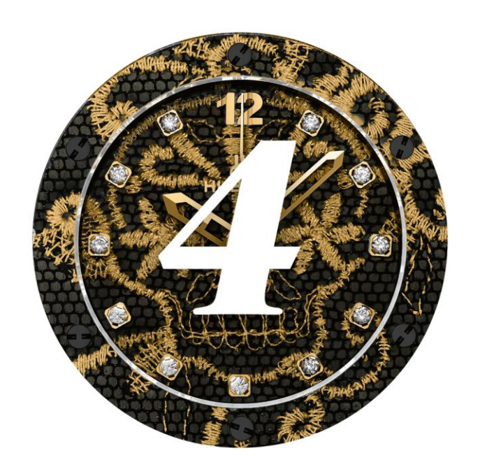
The Hublot Suite Mysterious journey through time

It is different, more mysterious and its overall appearance more masculine than any other room or suite. It comprises 68 sqm including master bedroom, living area and bathroom. And without question, the Hublot Suite revives the theme of watches with its unusual design. For the first time, the Swiss watch maker company presents itself with its own suite in a hotel.