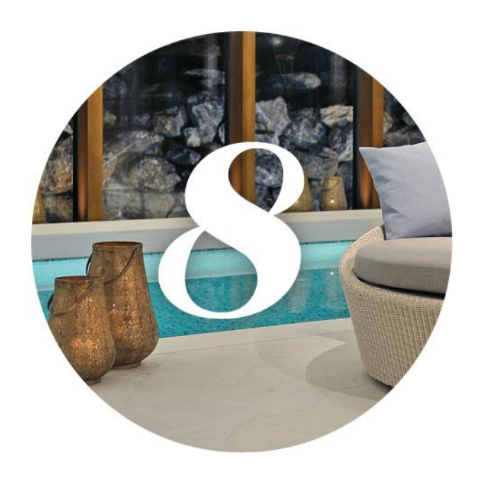
The dipiù Spa