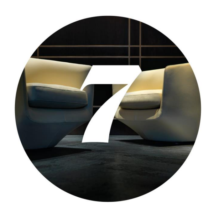
The Cigar Lounge Drag by drag of sheer pleasure

The luxury of a cigar is the time you spend with it. At our Cigar Lounge we created the atmosphere to go with it: elegant and serene. Leather club chairs are placed around a round table. Oxblood red wing chairs made from the finest velvet and three humidors of dark, Spanish cedar wood flank the lounge. Enthusiasts can enjoy a wide range of Habanos and Davidoff cigars along with all the accessories. A perfect place to enjoy life to the fullest.