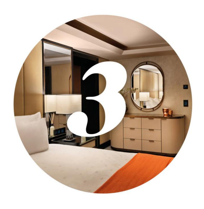
The Interior Design