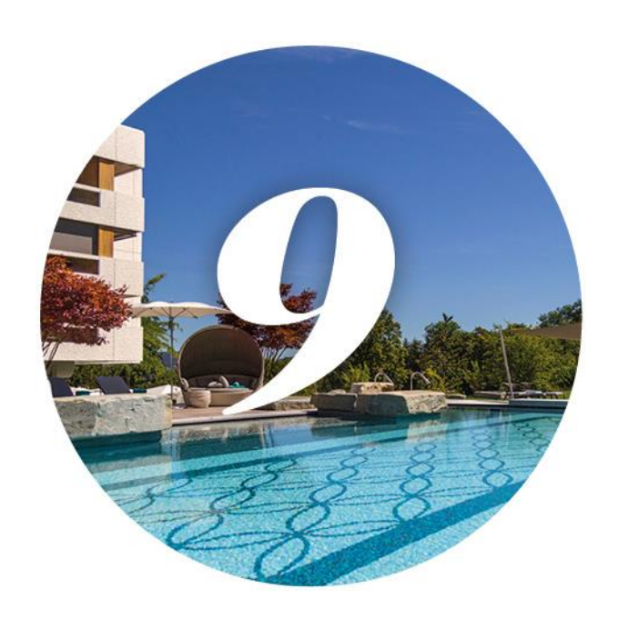
The Outdoor Pool Head above water

The dipiù Spa at the Atlantis by Giardino features treatment rooms, a sauna, steam room and relaxation areas, a Technogym fitness studio as well as an Aveda Hair Salon and a barber shop.